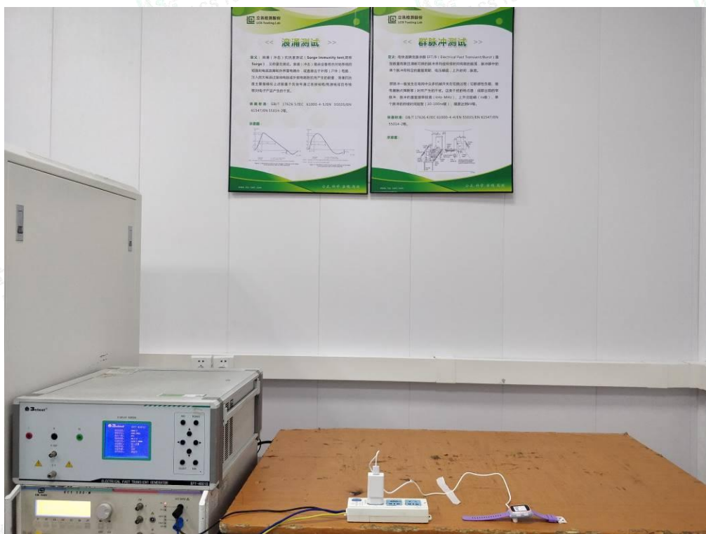
Fast Transients Common Mode