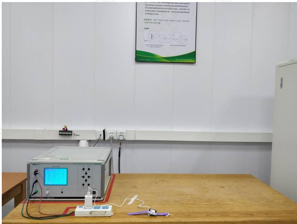
Voltage Dips and Interruptions