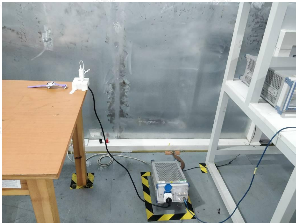
Power Line Conducted Emission