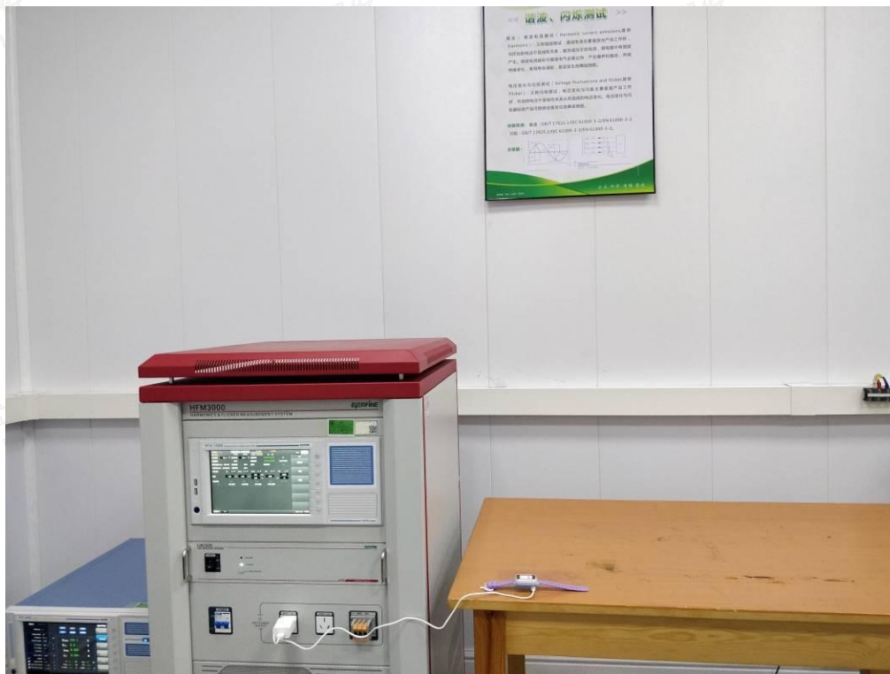
Voltage Fluctuations and Flicker